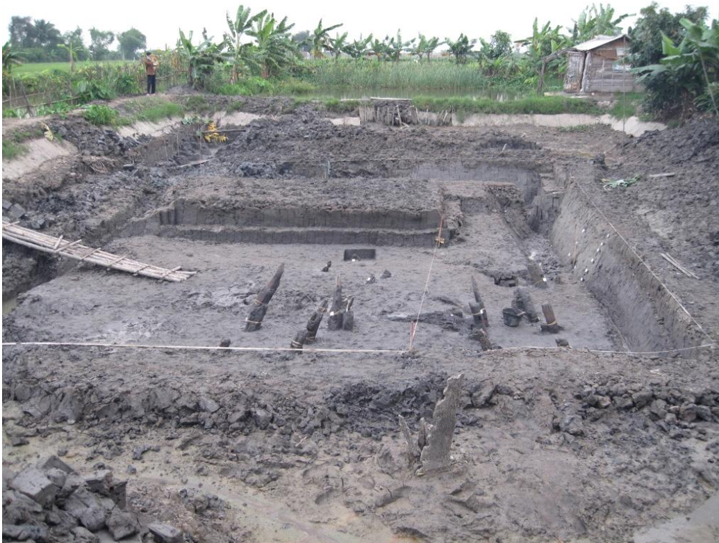
Figure 2. Dong Ma Ngua 2010, overview of trench H1 (right) and trench H4 (left) where 25 stakes were identified, photographed, analyzed and from which wood samples were extracted. The stakes diagonally driven are facing each other.

the site were recorded and photo mosaics of the site were also produced (Kimura and Pham 2010; Lê 2010).