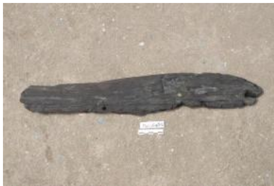
Figure 3. Fragment of oar.

A large number of artifacts were excavated, including the stakes and wooden fragments, pottery (ceramic and stoneware), bricks and tiles. A broken oar most probably associated with a small boat has been unearthed (Figure 3). Several small wooden artifacts have been interpreted as wooden tie rods. Some fragments have processing marks, such as rope holes for transportation or probably mortised holes. The flatness of some fragments suggests that they could be manufactured woodwork rather than stakes. Thus, it is possible that fragments of boats or ships have been found in this area. A large amount of degraded wood fragments and charcoal and a thick layer of blackish silt were observed in the excavated area, which indicates the use of firing.