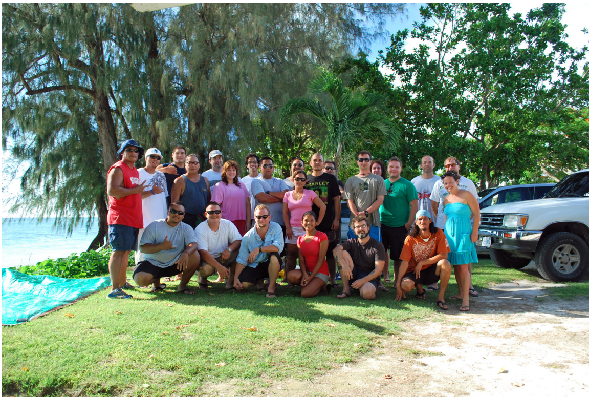
Figure 2. 2009 training participants, Saipan, CNMI.